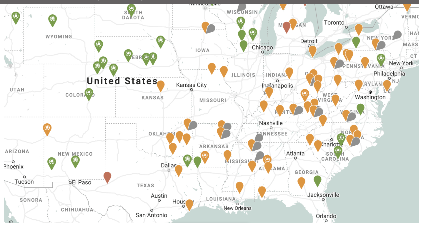
The RTT Collaborative has expanded the rural programs map on its website to now include 72 participating programs! Check it out on our website, or by clicking the link above.