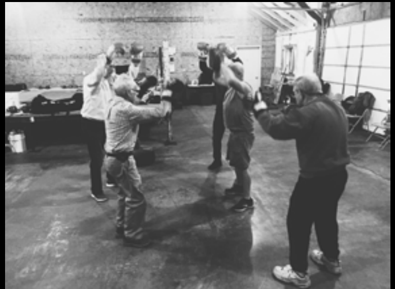
2019 first place