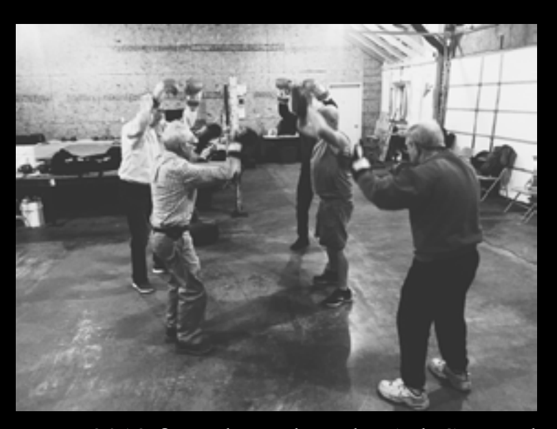
2019 first place photo by Ash Sampath